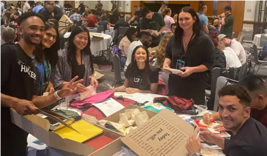
Huntress recently volunteered company-wide for the nonprofit School on Wheels , which equips students experiencing homelessness with backpacks and STEM-related school supplies.